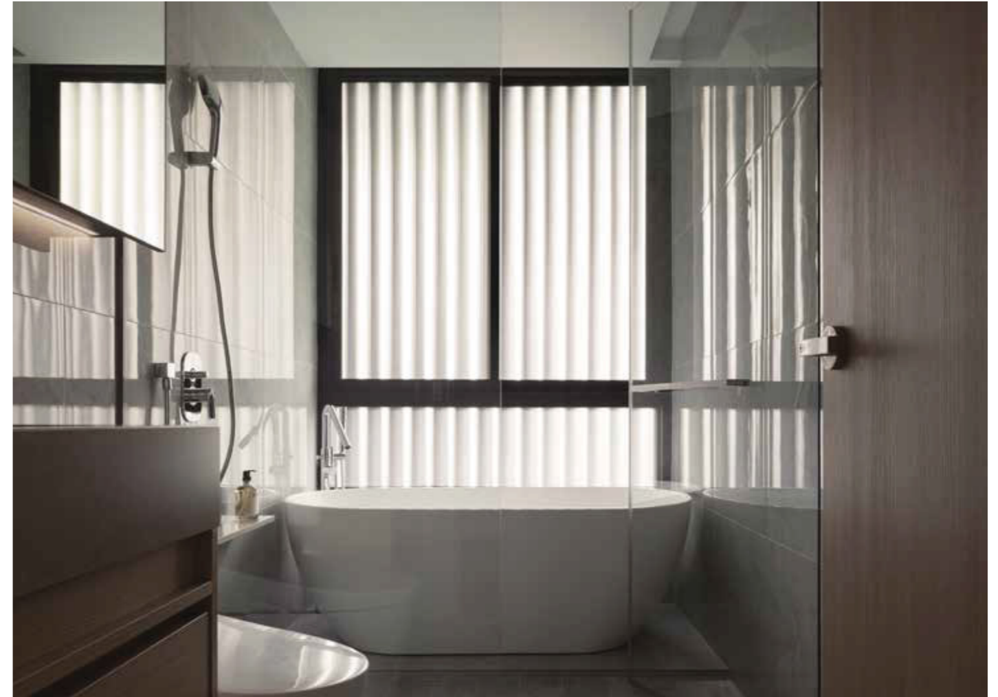
(Above) The occupants wanted a place that they could look forward to returning to at the end of the day.

Take the B&B Italia "Charles" sofa on the terrace, for instance. Although it had been part of their furniture collection from their previous residence, the client