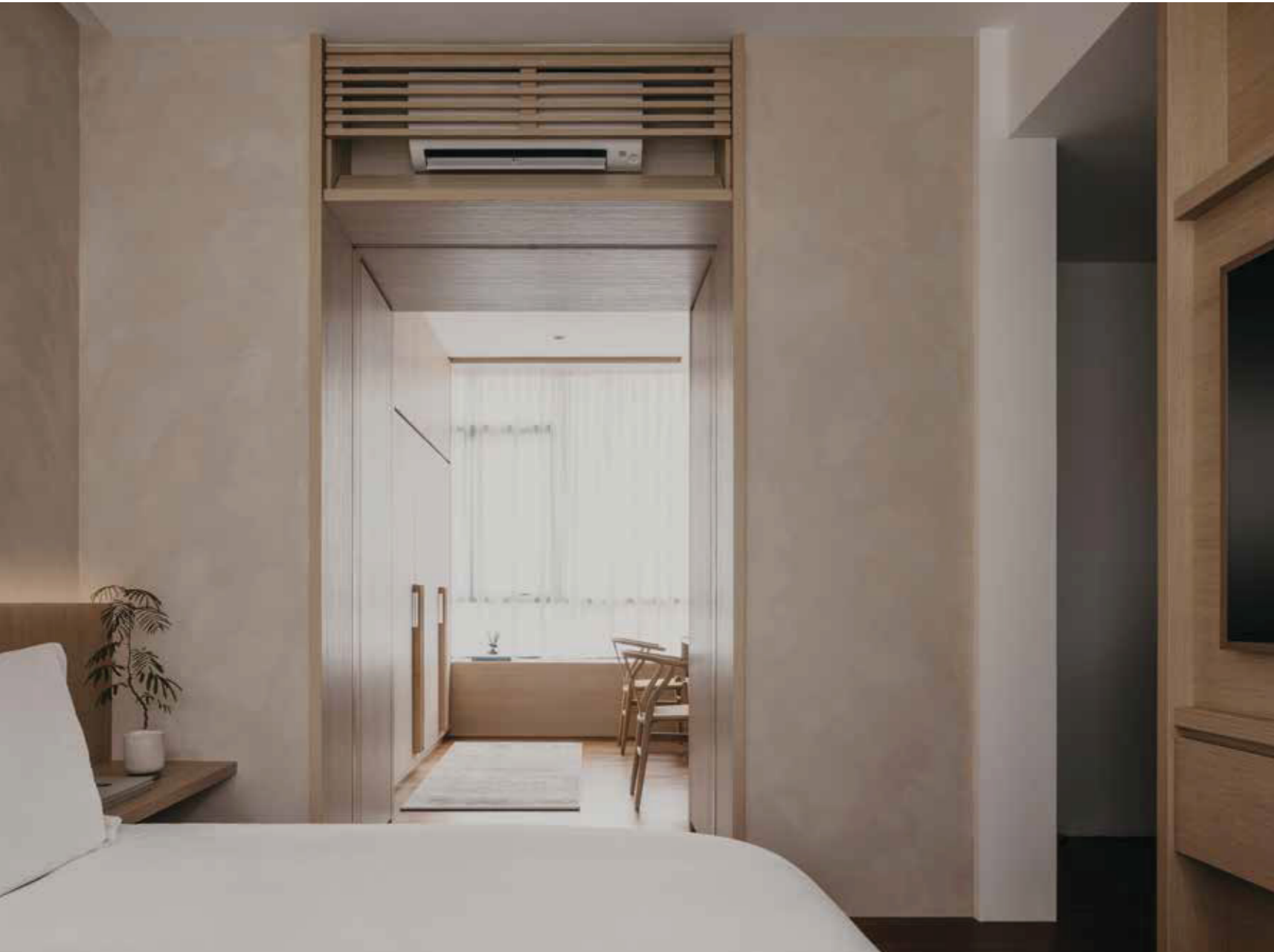
(Above) Lime-washed walls provide an authentic and unfinished treatment to the overall soft, minimal look.

Overlooking this double-volume space is an unobtrusive portal, which is neatly anchored to conceal entrances to the common washroom and back-of-house, offering additional depth to the rectilinear profile; the portal is a reference to Right Angle Studio's earlier works.